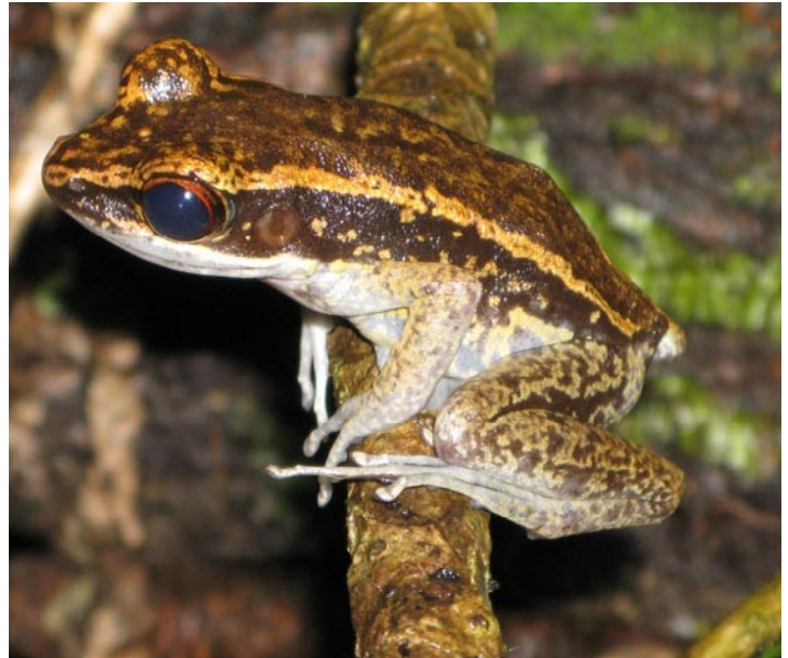
Rana similis is possibly declining at Mt. Palay-palay in the Philippines and has tested positive for Bd.

In our recent publication (Swei et al. 2011) we proposed three hypotheses to explain why Bd is not currently linked to significant amphibian declines in Asia: 1) Bd has not fully emerged in Asia, 2) Bd is endemic to Asia and shares an evolutionary history with native host species who are resistant, and 3) Bd emergence is inhibited due to abiotic or biotic conditions that are unique to Asia. We set out to evaluate these potential hypotheses by conducting the most extensive survey of Bd in Asia to date. Over the course of nearly a decade (2001-2009) our colleagues collected 3363 samples from frogs and amphibians from 15 countries in Asia, including Papua New Guinea. Most of these samples were tested using a quantitative PCR method that can determine the infection intensity on the animal measured in zoospores counts, but many samples were also tested using histology.