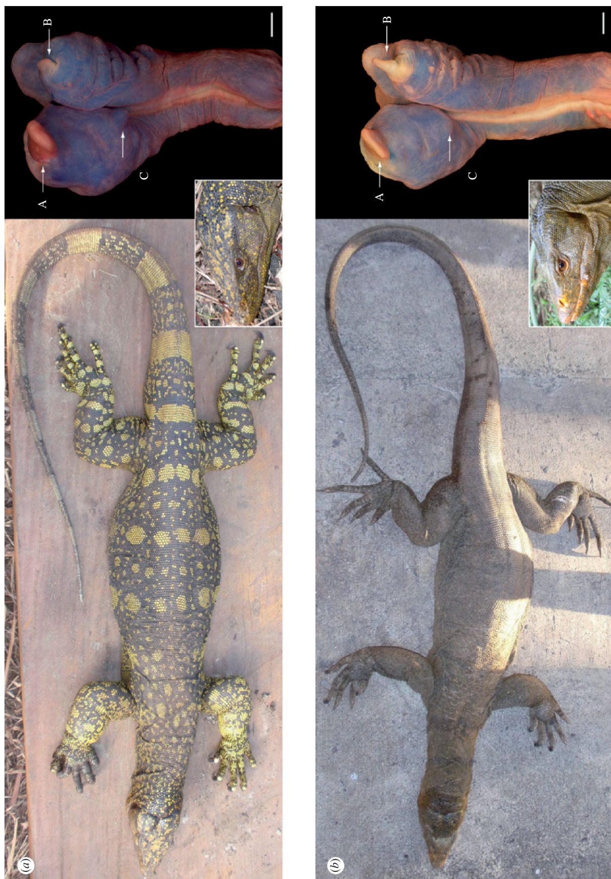
Figure 2. Dorsal views of bodies, lateral views of heads and close-ups of hemipenes of (a) V. bitatawa (PNM 9719) and (b) V. olivaceus (KU 322187). Letters indicate: A, primary apical hemibaculum horn; B, secondary apical hemibaculum horn; and C, presence or absence of an evagination at the base of the primary hemibaculum.