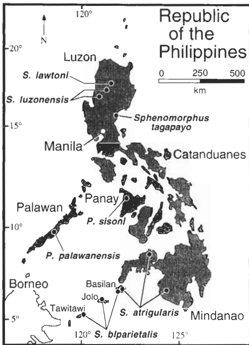
Fig. 1. The distribution of Sphenomorphus tagapayo in relation to the other members of Group II Sphenomorphus (Brown and Alcalá, 1980) and the members of the genus Parvosciencus (Ferner et al., 1997) in the Philippines (darkly shaded islands). Sphenomorphus sterei is known from all of the larger islands in the archipelago (Brown and Alcalá, 1980); individual localities are not shown.

head length (HL), head width (HW), head depth (HD), snout length (SL), interorbital distance (IOD), internarial distance (IND), eye diameter (ED), eye-nares distance (END), frontal length (FL), axilla-groin distance (AGD), fore-limb length (FLL), hind-limb length (HLL),