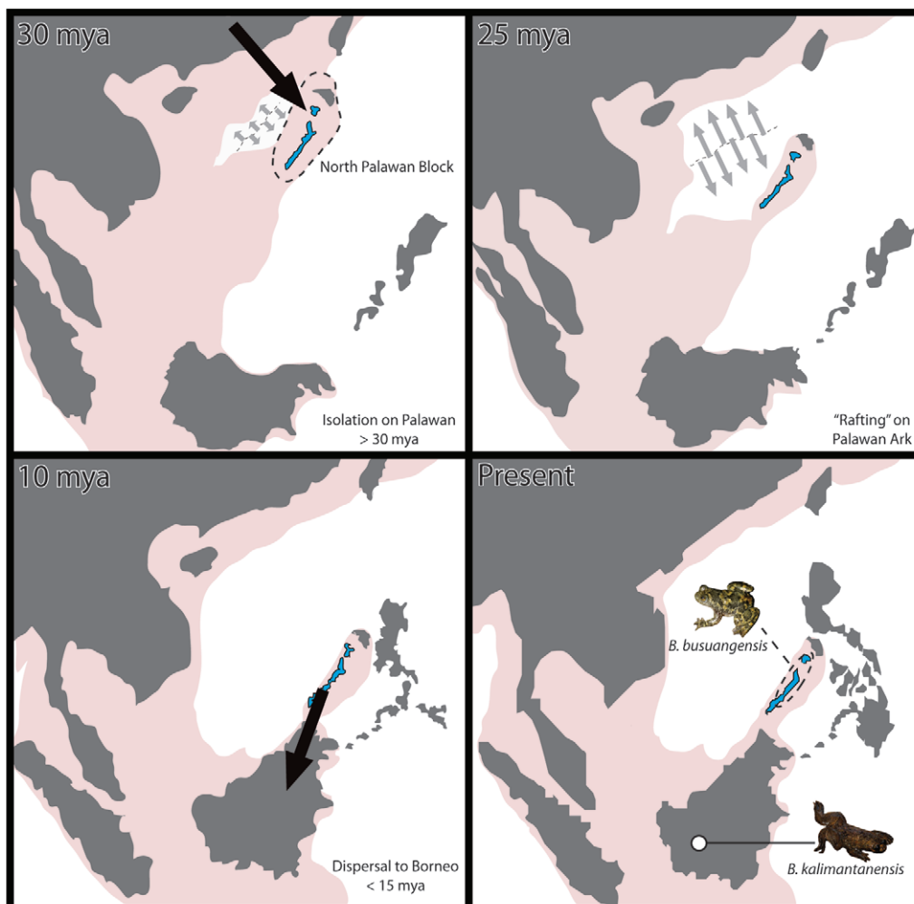
Figure 1. Proposed “Palawan Ark Hypothesis” based on reconstructions of geological history of Southeast Asia [16]. Pale red represents submarine continental margins. Large black arrows indicate proposed dispersal routes; small gray arrows indicate sea-floor spreading. doi:10.1371/journal.pone.0012090.g001

To determine the phylogenetic relationships, DNA sequence data were collected from three specimens of Barbourula : two of Barbourula busuangensis (KU 308965, 324598) and one of B. kalimantanensis (RMBR 1117). Genomic DNA was extracted from tissue samples using a guanidine thiocyanate method following the protocol of Esselstyn et al. [17]. Polymerase chain reaction (PCR) was used to amplify a region of mitochondrial DNA (~2000 bp) comprising genes encoding for 12S and 16S ribosomal RNA and the intervening valine transfer RNA. Three nuclear genes (CXC chemokine receptor 4– CXCR4 ; sodium-calcium exchanger 1– NCX1 ; solute carrier family 8 [sodium/calcium exchanger], member 3– SLC8A3 ) were also amplified by PCR; new primers were designed for two nuclear genes ( NCX1 , SLC8A3 ) based on previously published data (e.g., [18,19]). All primer details are provided in Table 1. The PCR conditions used were standard and the thermal cycle profile was as follows: 94°C (3 min; 35 cycles of 94°C (30 s), 50°C [for mt genes] or 55°C [for nuc genes] (30 s), 72°C (1 min); 72°C (7 min). Purification and sequencing follows